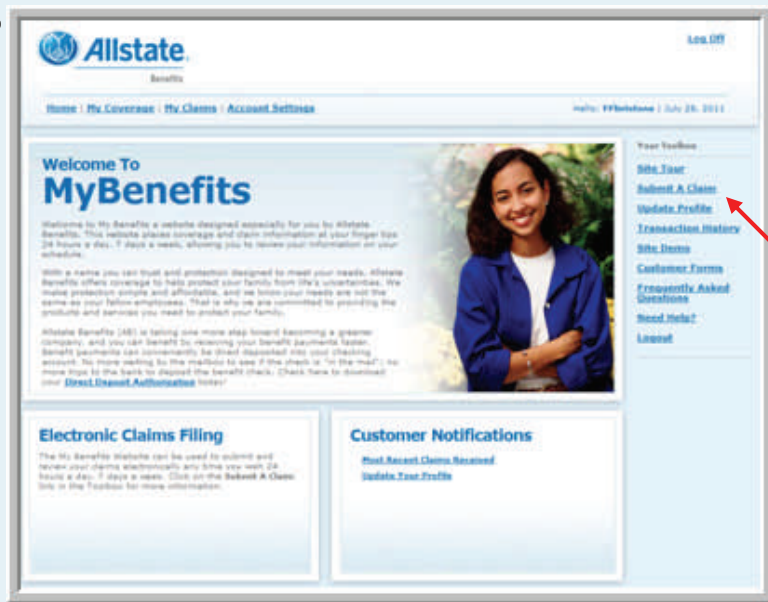
MyBenefits Home Screen, click "Submit A Claim"